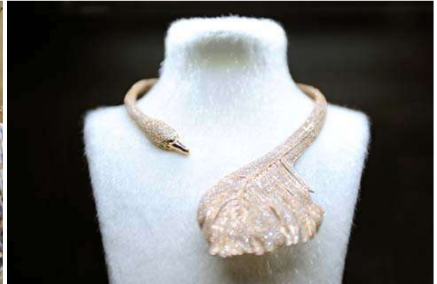
Istanbul Jewelry Show October