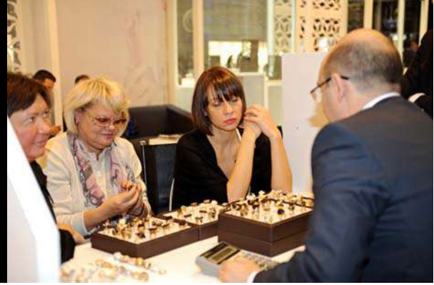
Istanbul Jewelry Show October_business meeting inside the booth

Supported by the Republic of Turkey Ministry of Economy, Small and Medium Enterprises Development Organization (KOSGEB), Jewellery Exporters’ Association (JTR), certified by the Union of International Fairs (UFI) and the Quality Management System ISO-9001, Istanbul Jewelry Show, targeting the Middle East, Eastern Europe, North Africa, Russia, CIS Countries, United States and Asia once again confirmed its professional and international status in the jewelry industry.