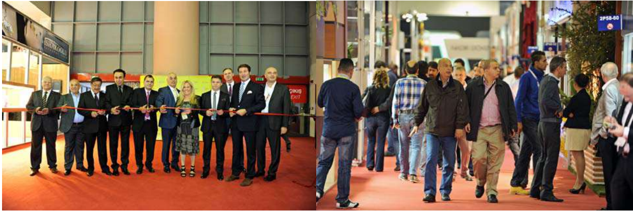
Istanbul Jewelry Show October_Opening Ceremony

The Istanbul Jewelry Show October 2013 received a remarkable 27% increase in total visitors compared to the 2012 edition. A total of 14.861 top buyers including 3.470 revisits, 67% of whom were domestic visitors and 33% overseas representing 95 countries , convened across four days to conduct business and meet suppliers and buyers from all over the world.