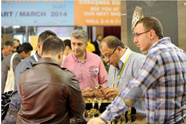
Istanbul Jewelry Show October_business meeting